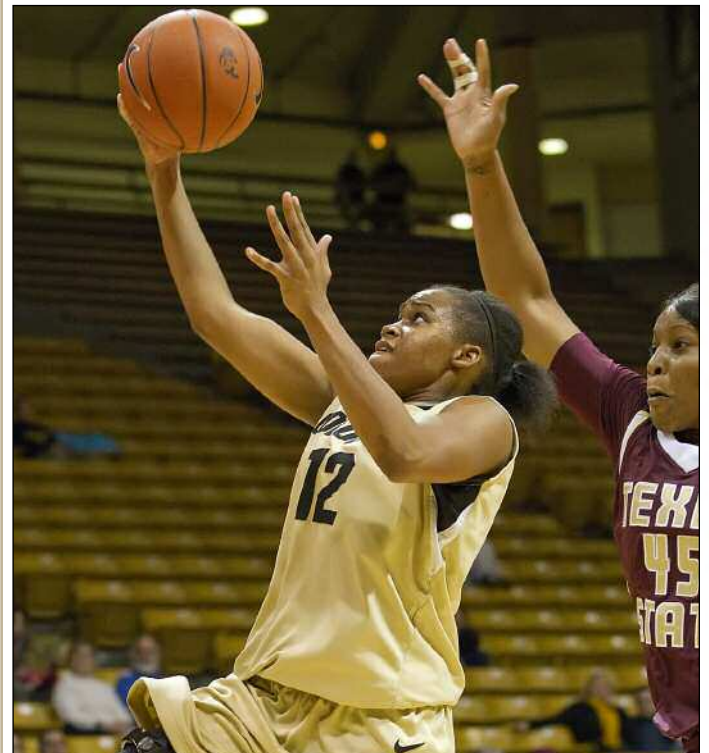
CU's defense held back-to-back opponents under 40 points for the first time in team history in 2010 (Loyola Chicago 34, Texas State 35).